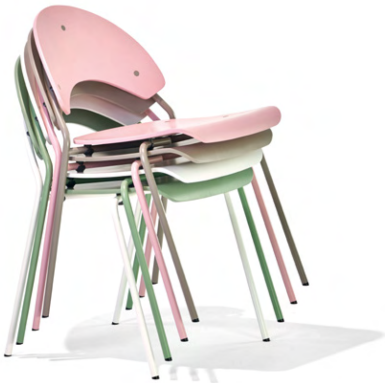
Stackable, up to 10 chairs