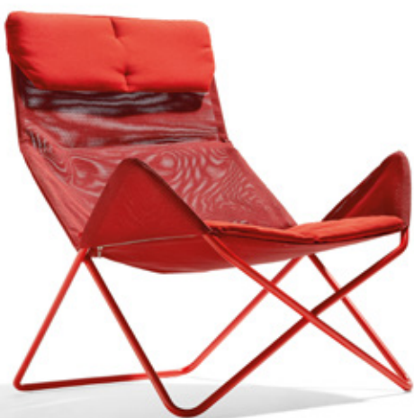
In-Out Outdoor with cushion