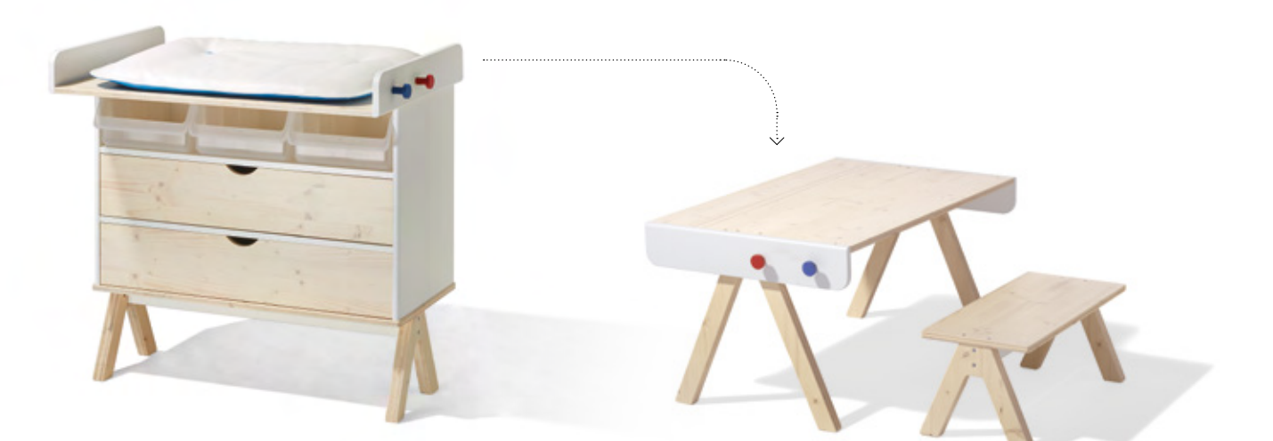
Chest of drawers, wide with plastic box large